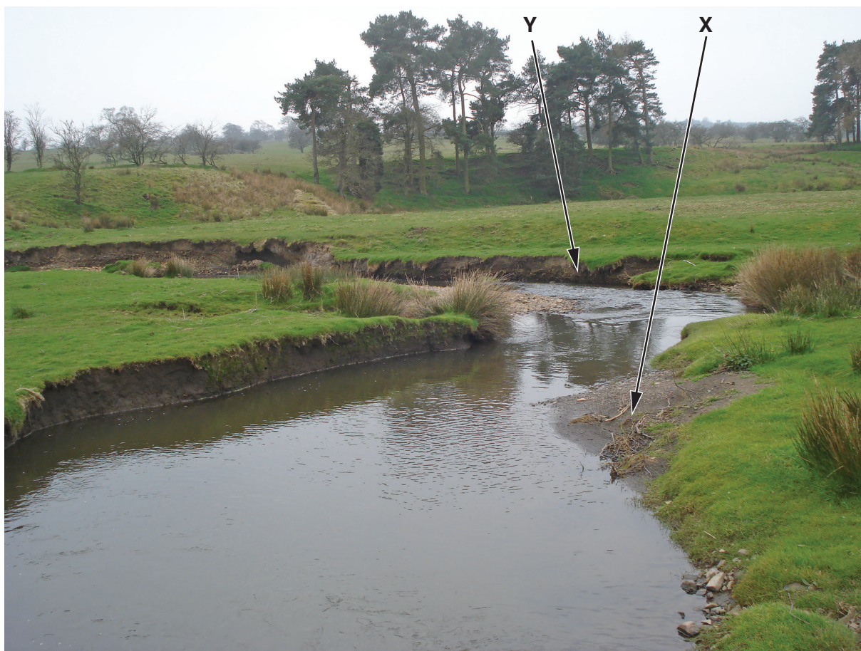
Fig. 4.1 for Question 4