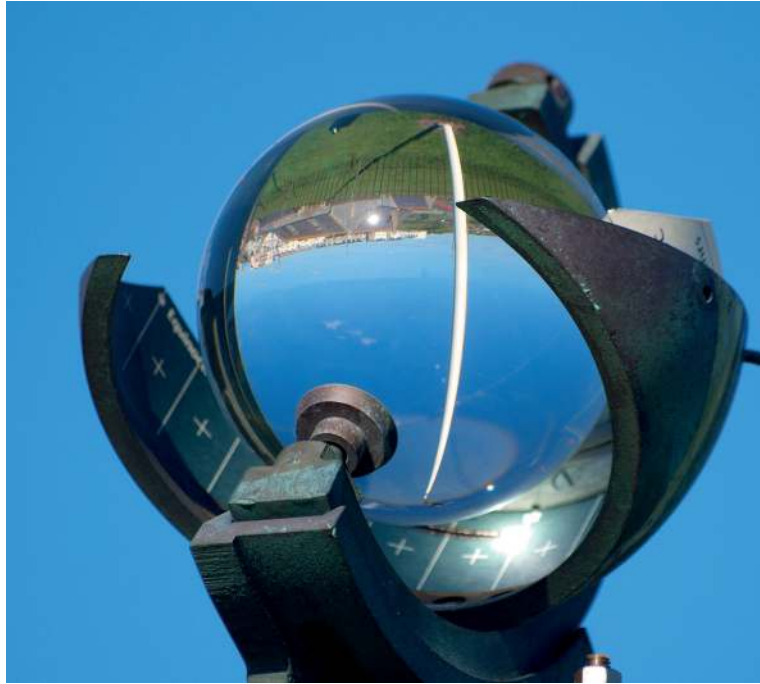
Photograph A for Question 1