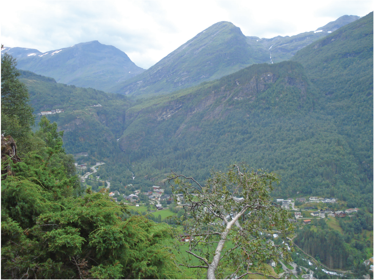
Fig. 1.2 for Question 1