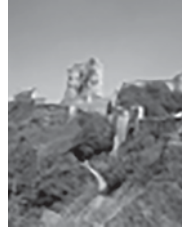
The image after the change