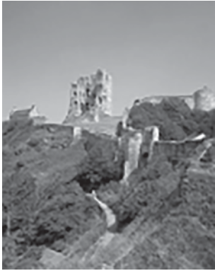
The image before the change