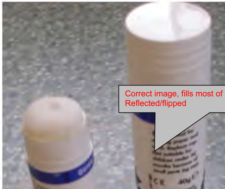
Image for the glue webpage

Correct image, fills most of the slide Reflected/flipped 1 mark 1 mark